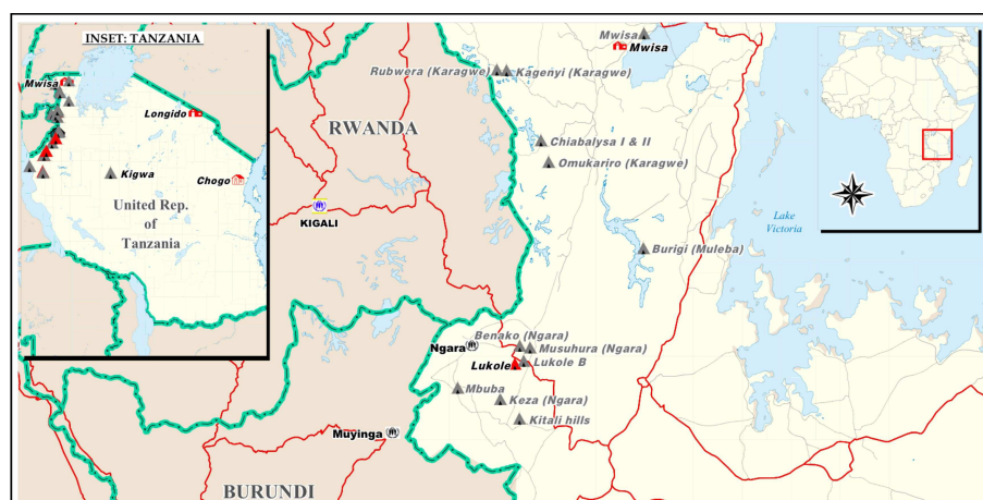
Figure 1: The Kagera region and the location of refugee camps