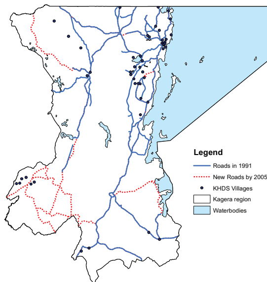
Figure 4: Road networks

Note: KHDS = Kagera Health Development Survey